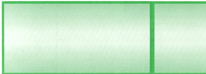
Style #1 - Border

Style #1 – Flood: 2" x 5.5" with 2 stubs, perforations at 1.5" from right leading edge. Colours available are blue, purple, green, yellow, red and peach.