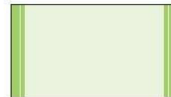
** Green #375

Drink Tickets: 7.5 Thermal Tag. 1 31/32" x 1.1", Perforations at 1.1" from right leading. Black timing bar on back with UV pattern.