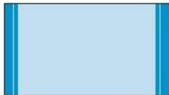
** Process Blue